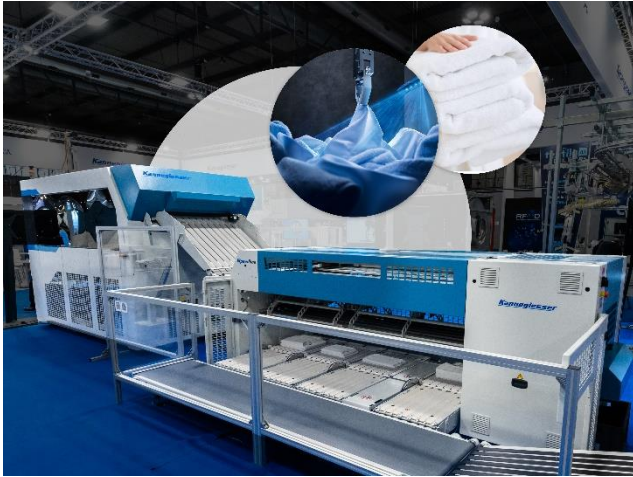
The automatic dry laundry line.

The principle of a fully automatic terrycloth folding system is usually based on modern image recognition systems and sensors. These enable one or more robot arms to recognise, grip, align, identify or measure an item in a laundry trolley, feed it to the folding machine, fold it with the appropriate folding programme and then stack it. Depending on the manufacturer, these processes are carried out in accordance with specific procedures, which also influence the performance of the machine. According to Kannegiesser, this results in an hourly folding rate between 600 and 700 items, depending on the variety of items to be processed. For example, a person is still faster than a machine when folding smaller items of laundry, such as flannels.