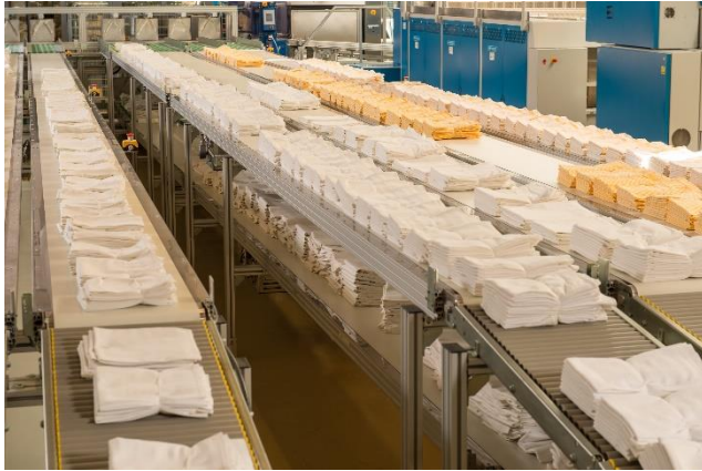
Stacked linen storage system.